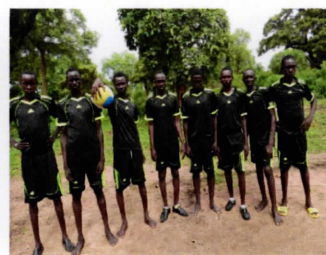
S3 (Junior) Team