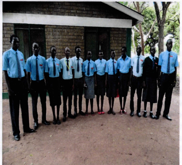
In coming 2017 Student Leadership

Certificates of merit and prizes are awarded to the leaders at the end of their term of office.