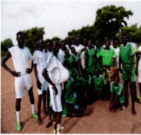
S1 (Freshman) Team