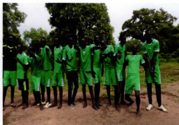
S2 (Sophomore) Team