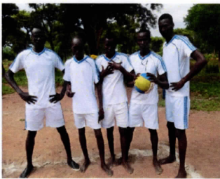
S1 (Freshman) Team