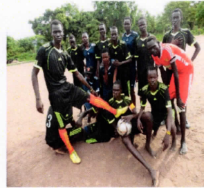
S3 (Junior) Team