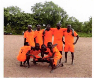
S4 (Senior) Team