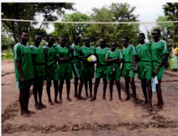
S1 (Freshman) Team