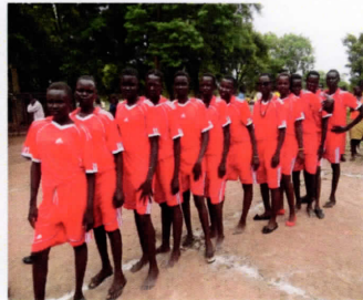
S2 (Sophomore) Team