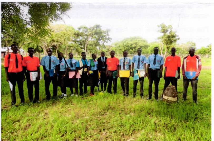
Out going 2016 Student Leadership