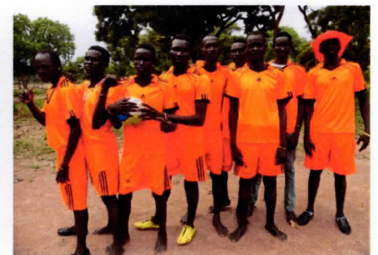
S4 (Senior) Team