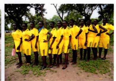
S4 (Senior) Team