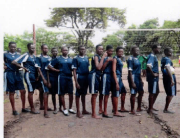
S3 (Junior) Team