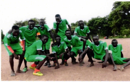
S2 (Sophomore) Team