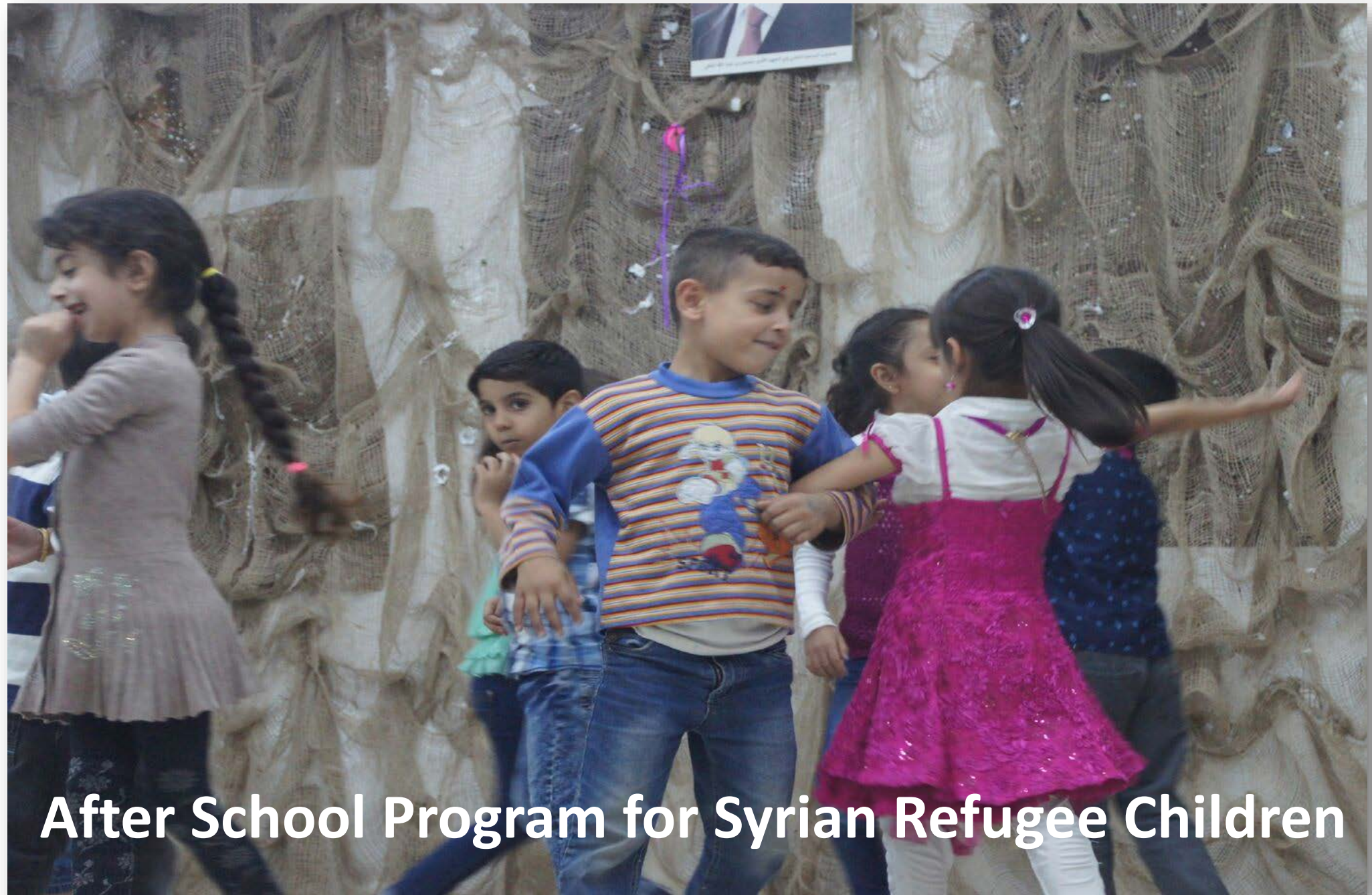
After School Program for Syrian Refugee Children